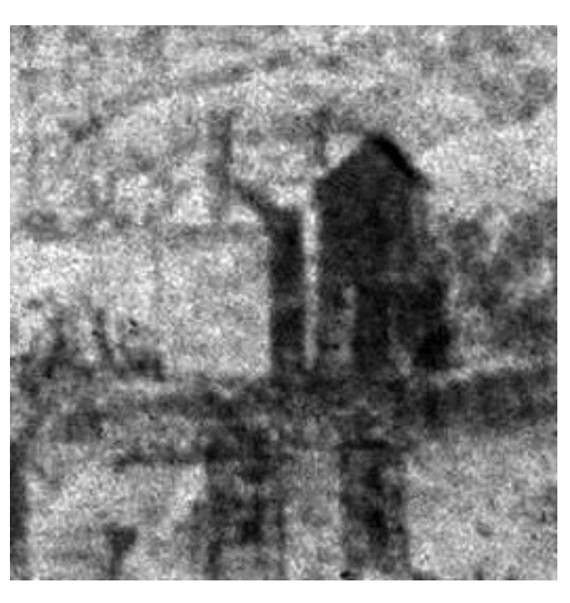
Sion House from the north - Charles Norris c 1820

and by 1805 her representatives were referring large sum immediately to be made up for Government Duties"; the Journal was sold a year later. But even if Catherine were not able to utilise the capital tied up in a trust, if it held a lot of property there should have been a substantial income from it. How real was the trust? What did it actually hold? Could it merely have been a device for putting property temporarily "out of sight"?